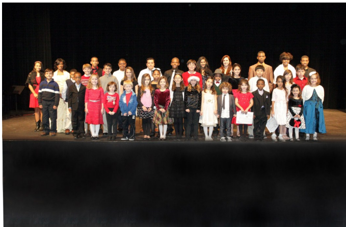
4:00 PM RECITAL (From Left to Right)