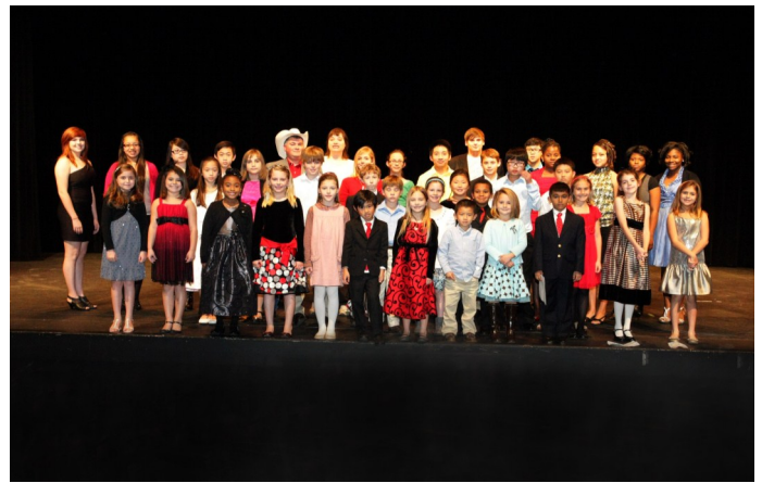
6:00 PM RECITAL (From Left to Right)