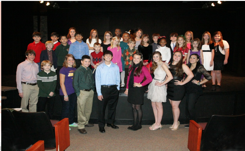
10:00 AM RECITAL (From Left to Right)