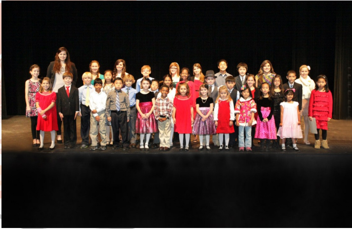
12:00 PM RECITAL (From Left to Right)