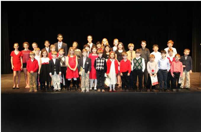
2:00 PM RECITAL (From Left to Right)