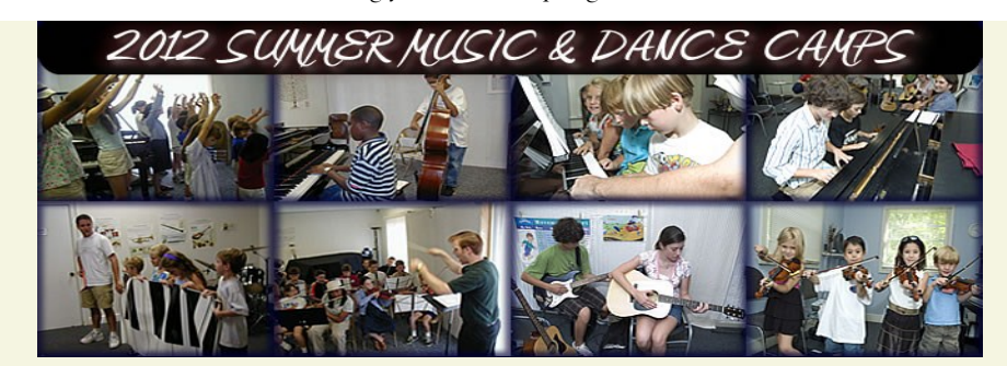
REGISTER NOW FOR A SUMMER OF FUN THIS JULY! SPACE IS EXTREMELY LIMITED. VISIT <u>LAAPA.COM/CAMP</u> OR THE FRONT DESK FOR MORE INFORMATION!

Southshore Students - mandatory practices will be held on Saturday, May 26th, June 2nd and June 9th, for all students that are participating. Two of the three practices must be attended in order to perform. We look forward to hearing you all at the Spring Recitals!