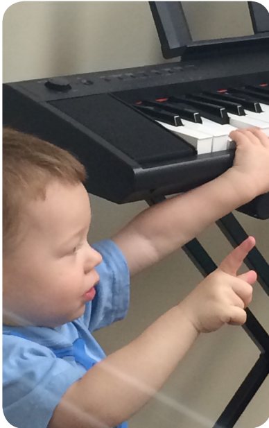
Pictured above - Exploring the keyboard during Preschool Music class!