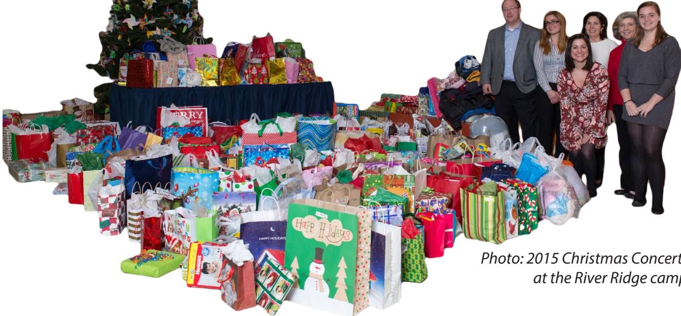
Photo: 2015 Christmas Concert Donations at the River Ridge campus

Each Christmas, hundreds of families at LAAPA come together and donate gifts, clothing, and other basic needs items to support families in Batesville, Texas through the Teresian Sisters. For more information on how you can help, please visit http://www.laapa.com/mission . We will be accepting donations at our concerts held on Dec. 10, 16, 17, and 18. At the end of each day, we pack them up and drop them off to the Teresian Sister's Provinciate in Covington where they sort and prepare to transport them directly to the needy.