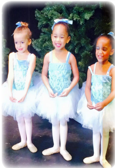
(pictured above) River Ridge School of Music & Dance Ballerinas getting ready for their performance!

Louisiana Academy of Performing Arts 2020 Dickory Ave. #200 Harahan, LA 70123 www.laapa.com | (504) 208-2301