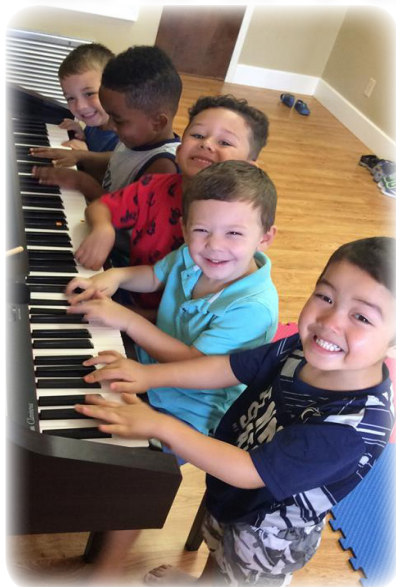
(pictured above) Preschool Music II class discovering the piano!