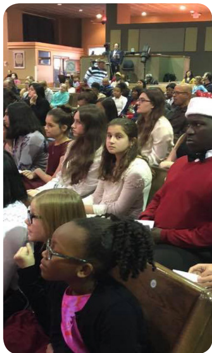
Above: Crowd shot at one of our Christmas recitals! Right: Christmas Dance Production at Loyola

It's a pleasure to have you all joining us and we look forward to helping you achieve all of your goals!