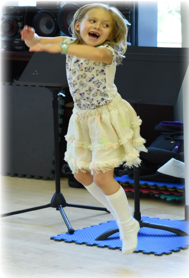
(pictured above) A summer camper getting in some air time during acting class!

Louisiana Academy of Performing Arts 2020 Dickory Ave. #200 Harahan, LA 70123 www.laapa.com | (504) 208-2301