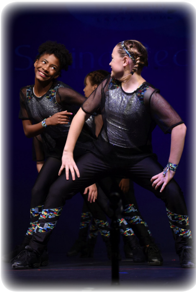
Mandeville School of Music & Dance Hip-Hop II students were all smiles during their show last month!

Louisiana Academy of Performing Arts 105 Campbell Ave #3 Mandeville, LA 70471 www.laapa.com | (504) 208-2301